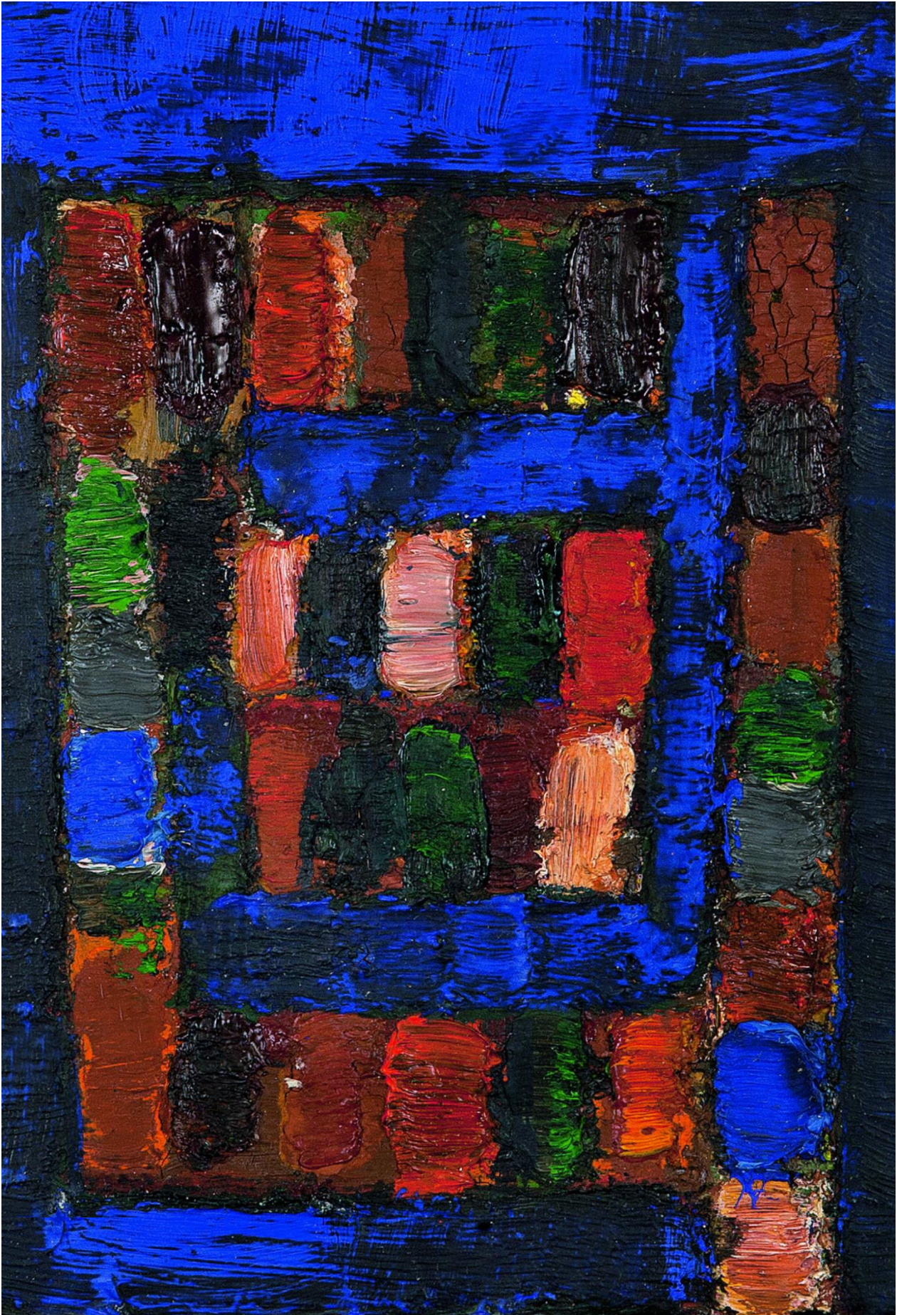
1. Jean-Michel Coulon, 1950