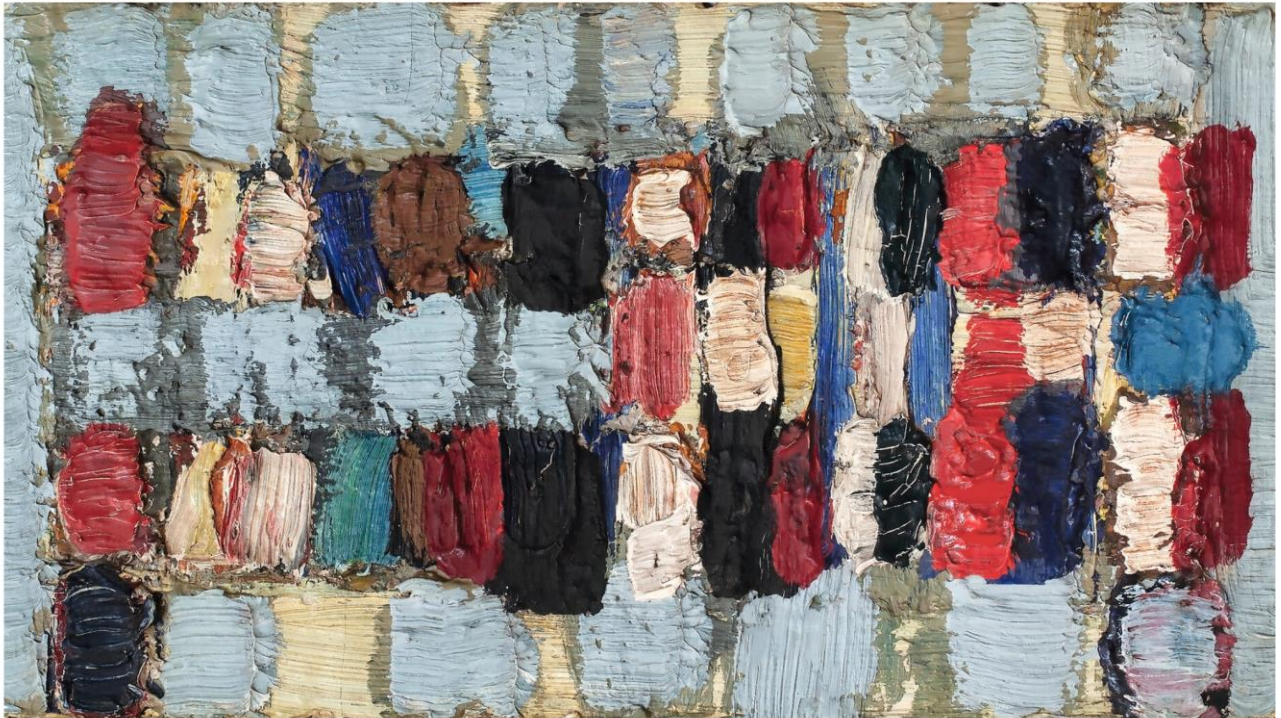
Untitled. c. 1970. Oil on wood, 8.9 × 7.1 in., catalogue raisonné N° 0256H